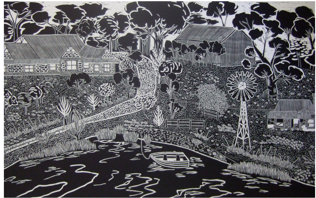
Image: Coorong, lino print

2011, Commendation Award, 'Schizophrenia Awareness Week Exhibition'