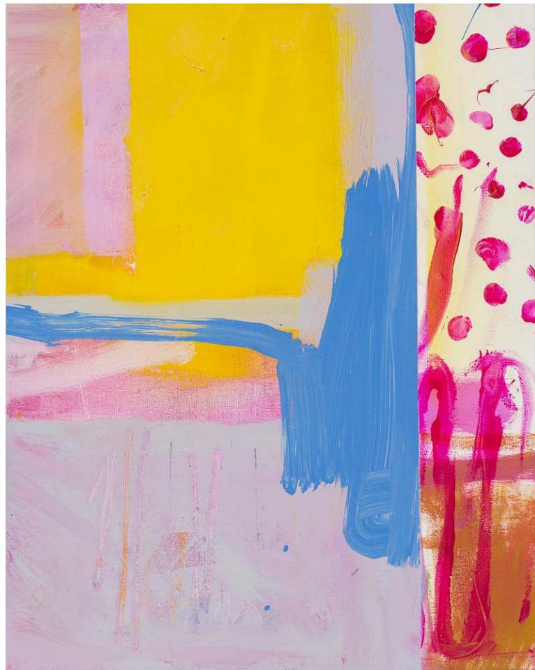
Lush Life Oil on canvas 40 x 70cm $450