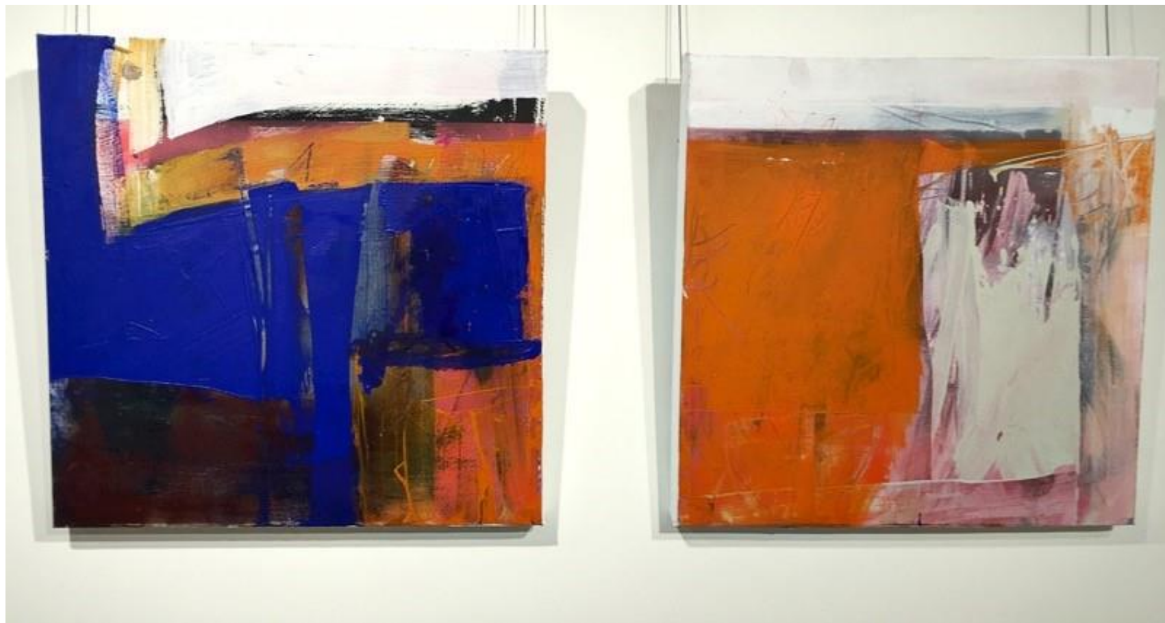
Kangara Mixed Media on canvas 90 x 45 cm $450