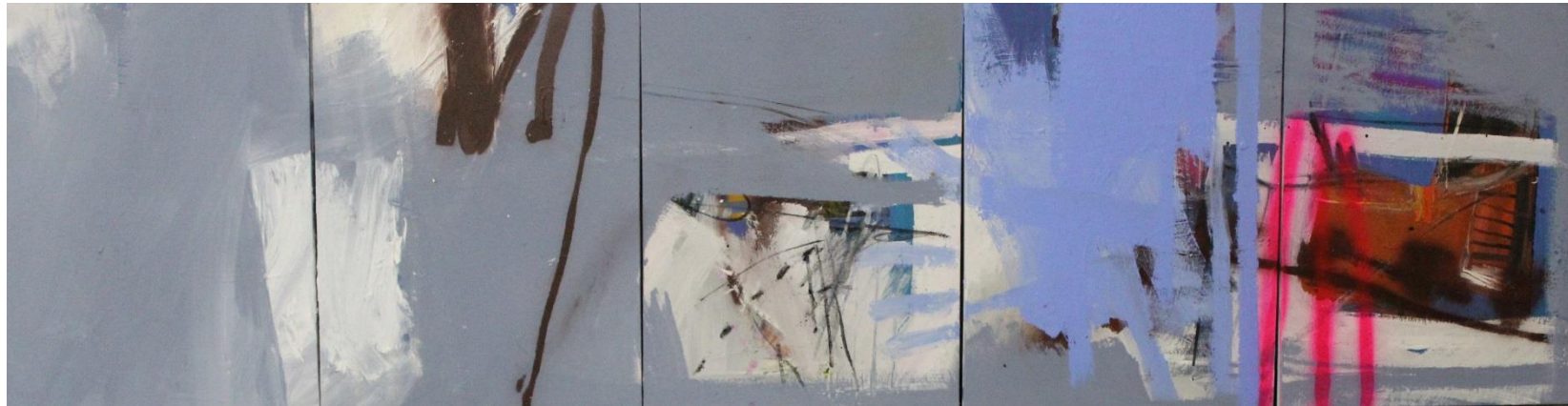
Drummoyne Mist Mixed Media on canvas 40 x 150 cm $2500