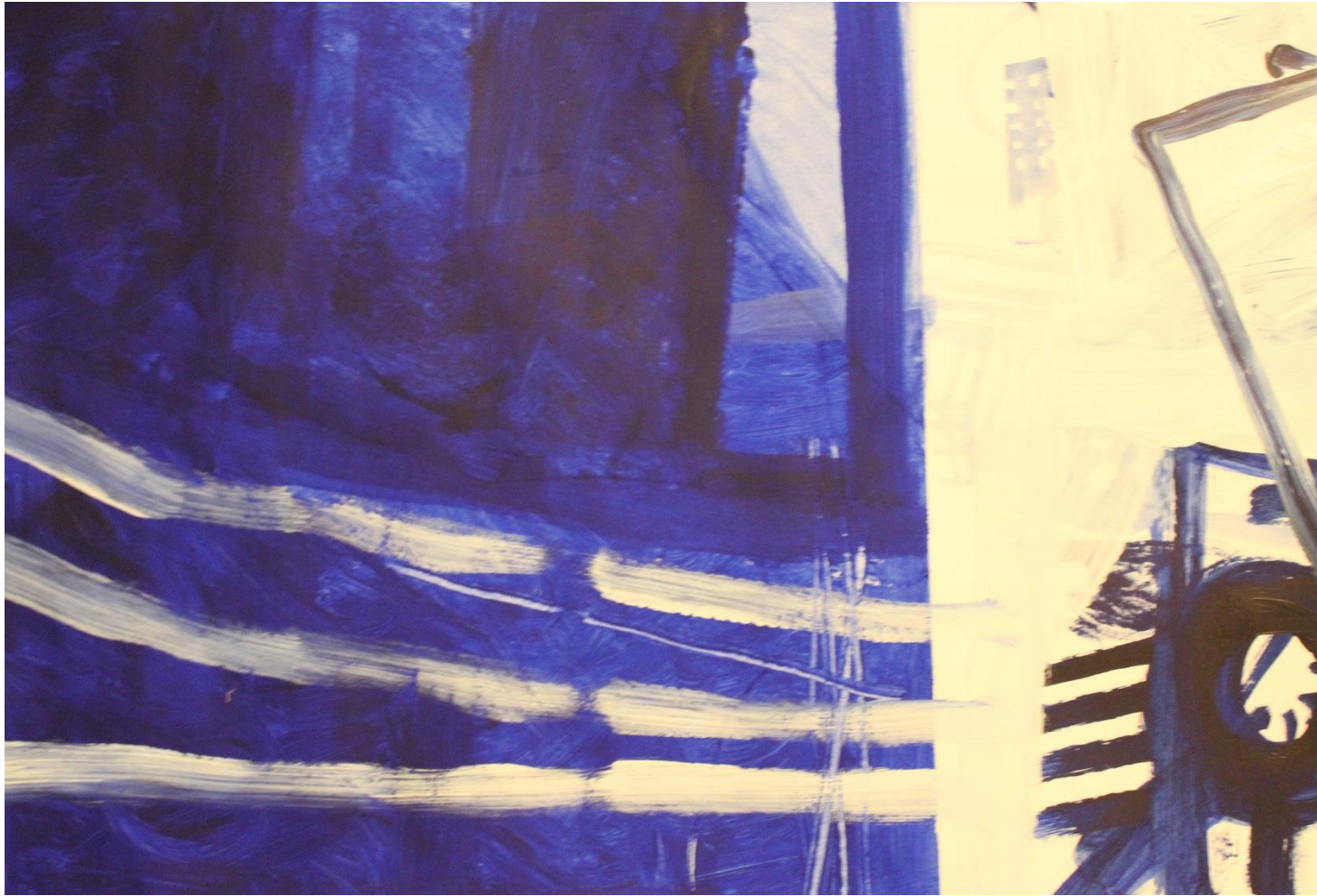
The Blue wharf Work on paper framed 40 x 80 cm $300