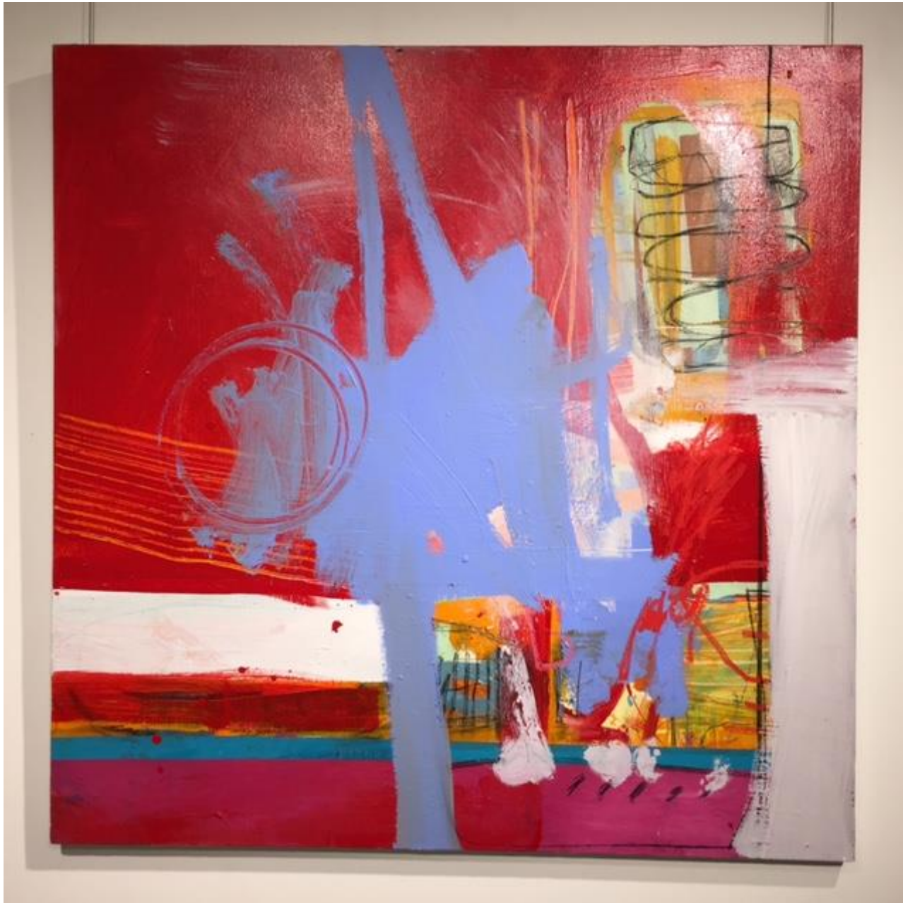
This Feeling (Redfern inside diamond rain) Mixed Media on canvas 90 x 90 cm $1700