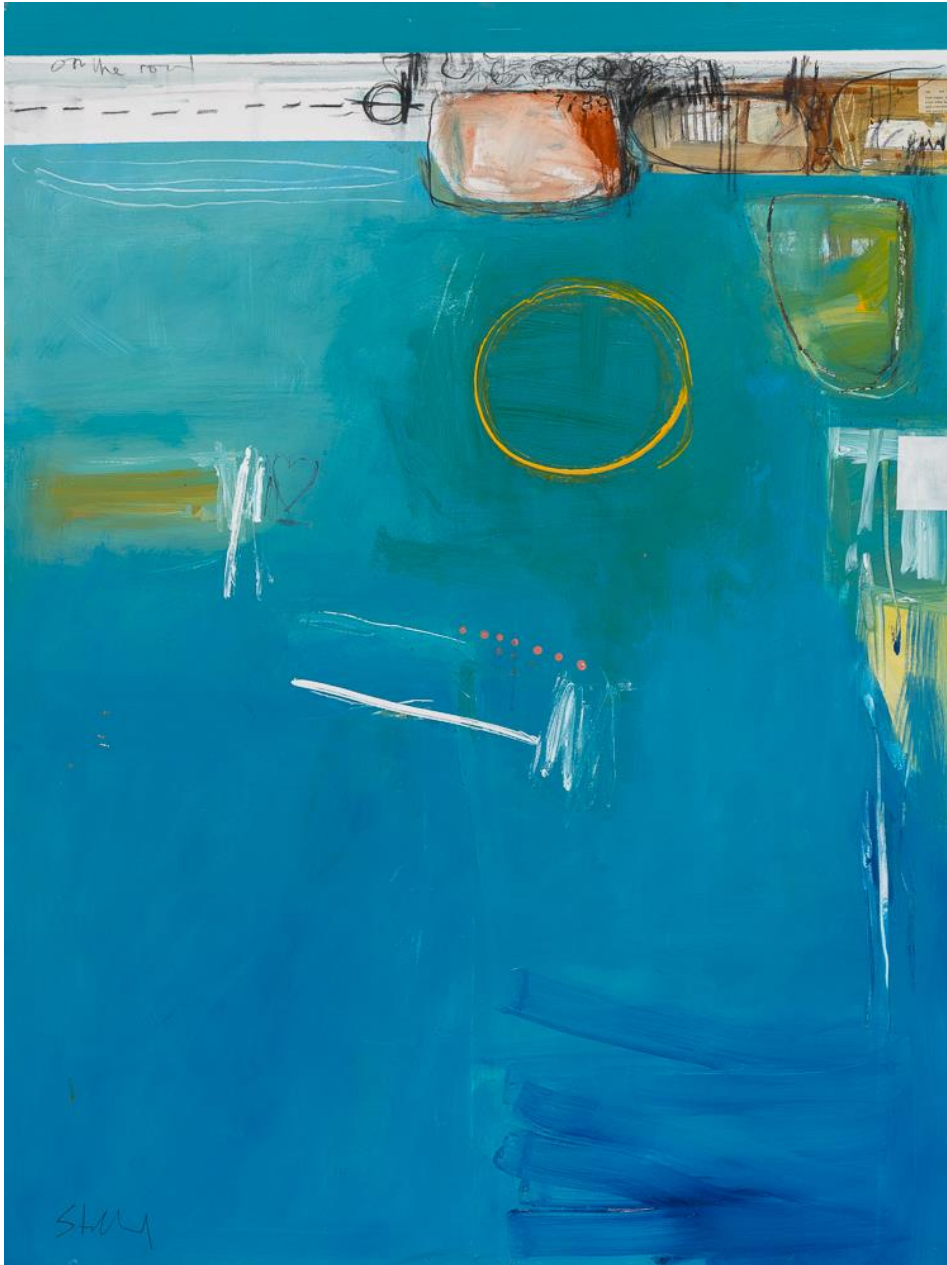
On the Road Mixed Media on Canvas 120cm x 190cm $2500