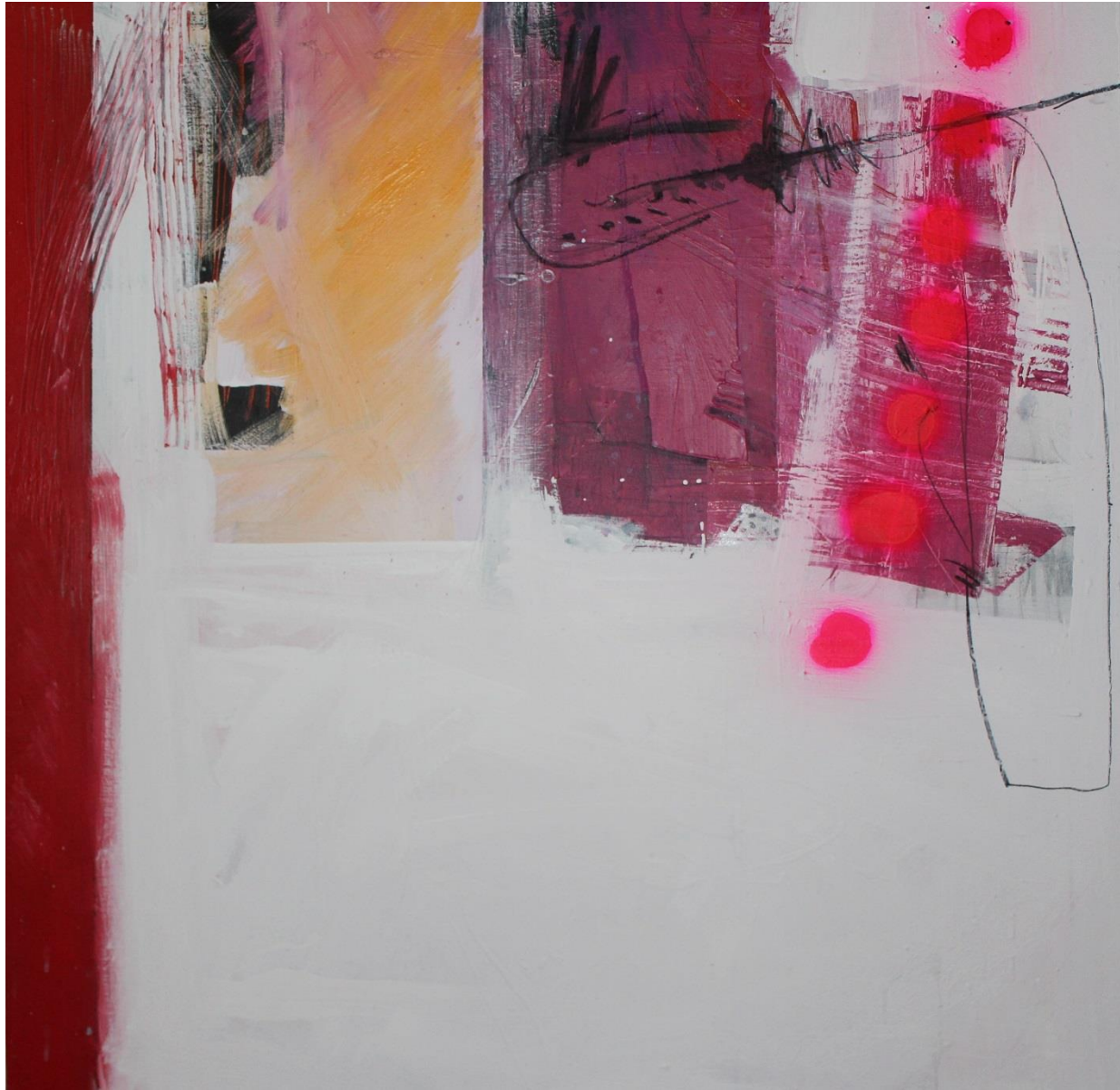
The Singing bird Mixed Media 90cm x 90cm $2000