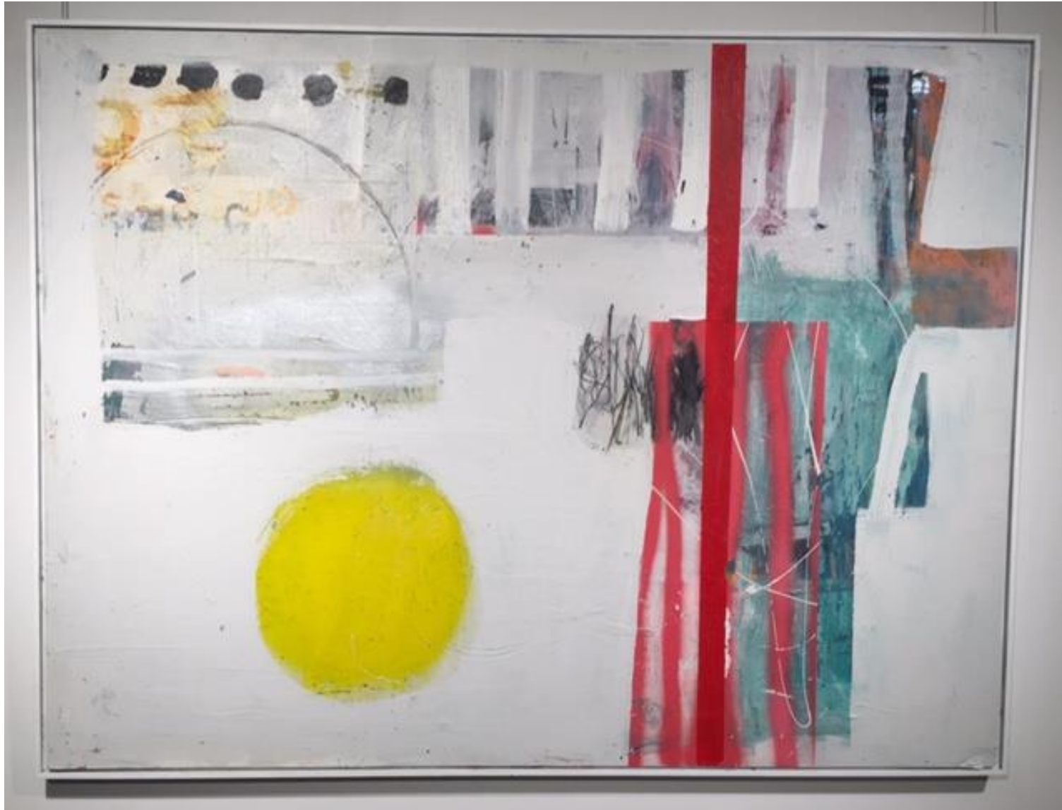
Memory Wall Mixed Media 90 x 125 cm $2200