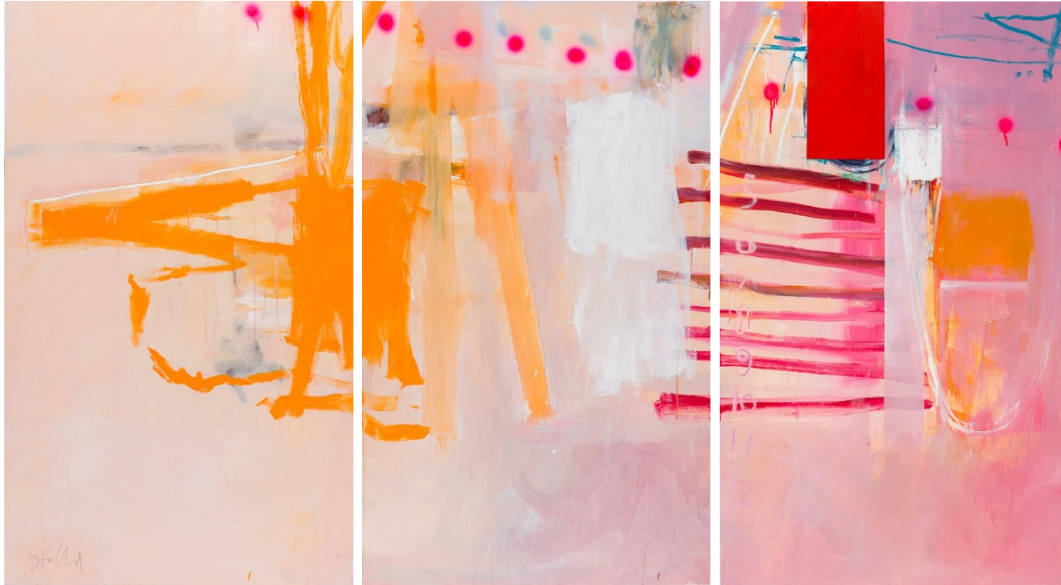
Sydney Morning Bell Mixed Media on canvas 180cm x 280cm $5000