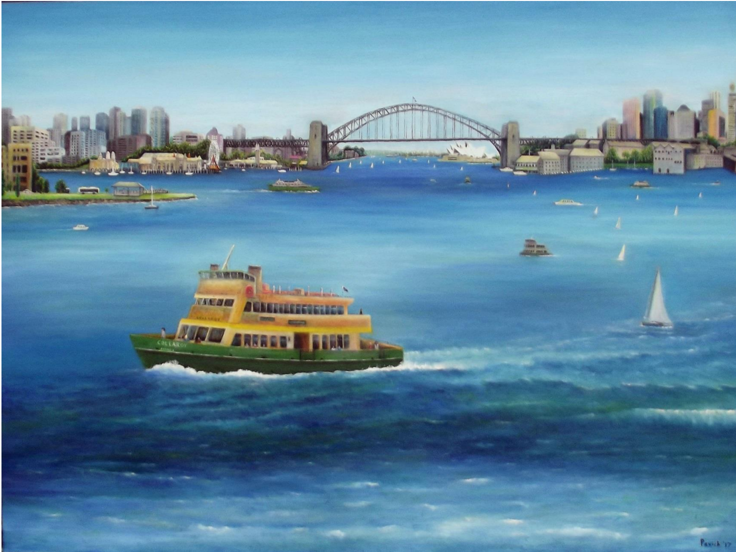
Harbour (Summer), 2017 Oil on Poly Cotton 140cm x 186cm $7500