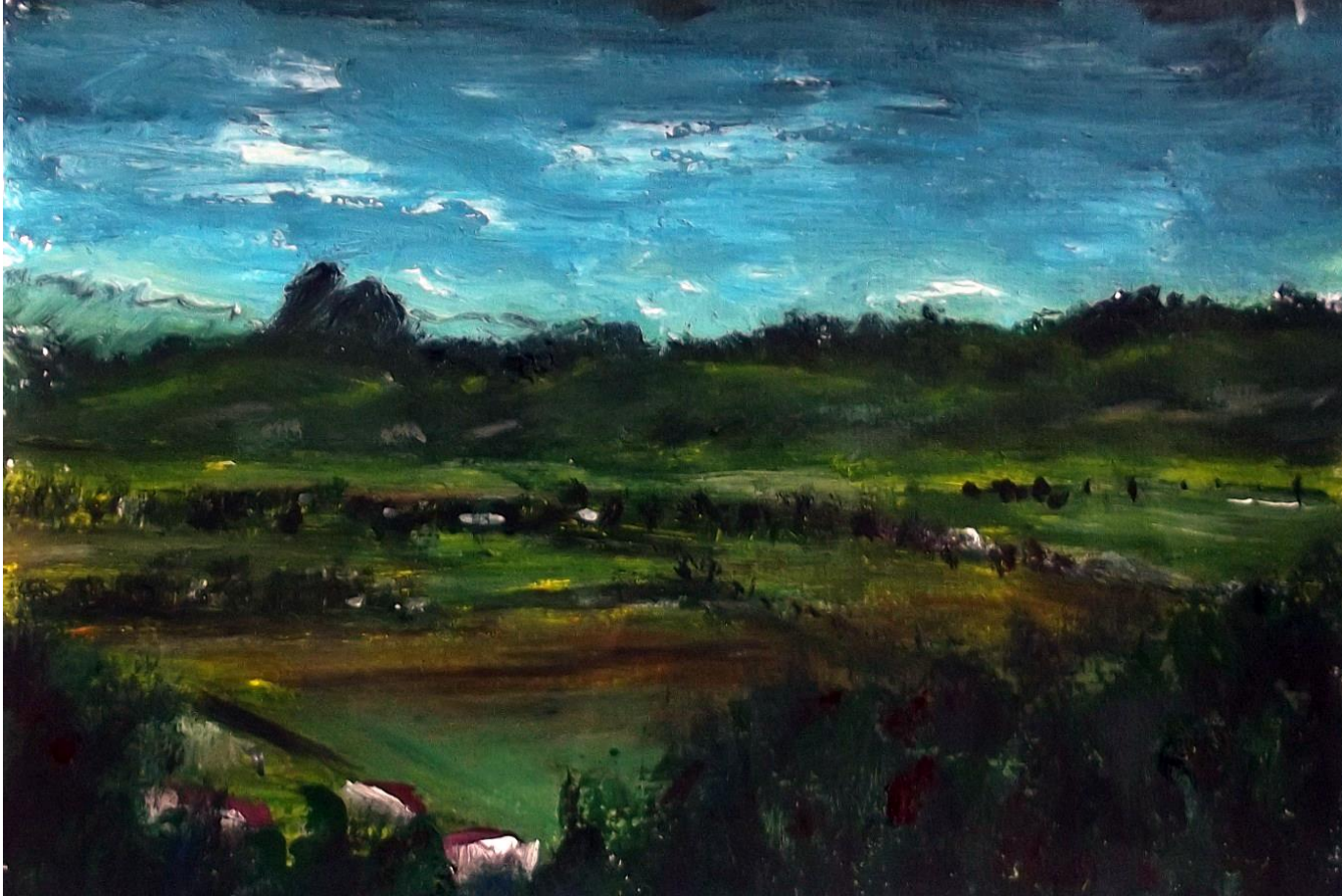
Towards Springbrook from Murwillumbah, study, 2015