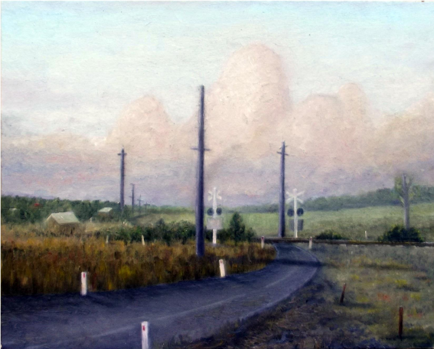
The Crossing (Scone), 2014 Oil on Poly Cotton 50cm x 60cm $1800