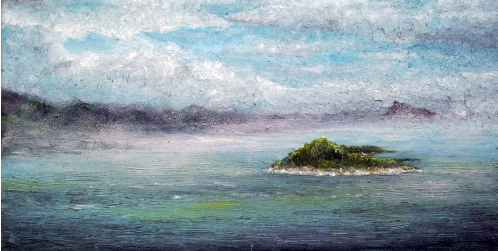
Hamilton Island towards Dungurra Island, 2014 Oil on Poly Cotton 15cm x 30cm $600 (Framed)