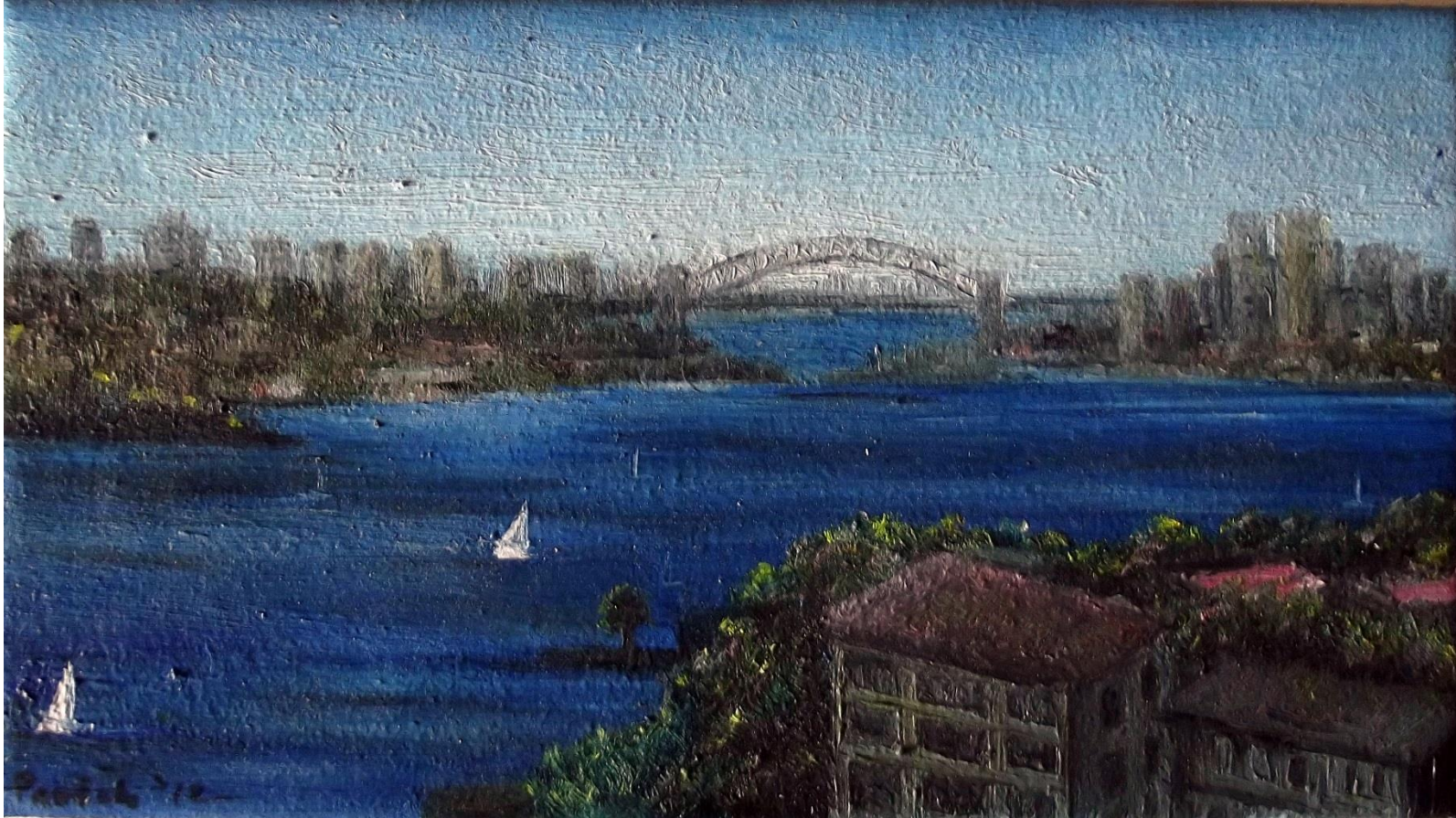
From the Gladesville Bridge, 2010 Oil on Poly Cotton 15cm x 26cm $550 (Framed)