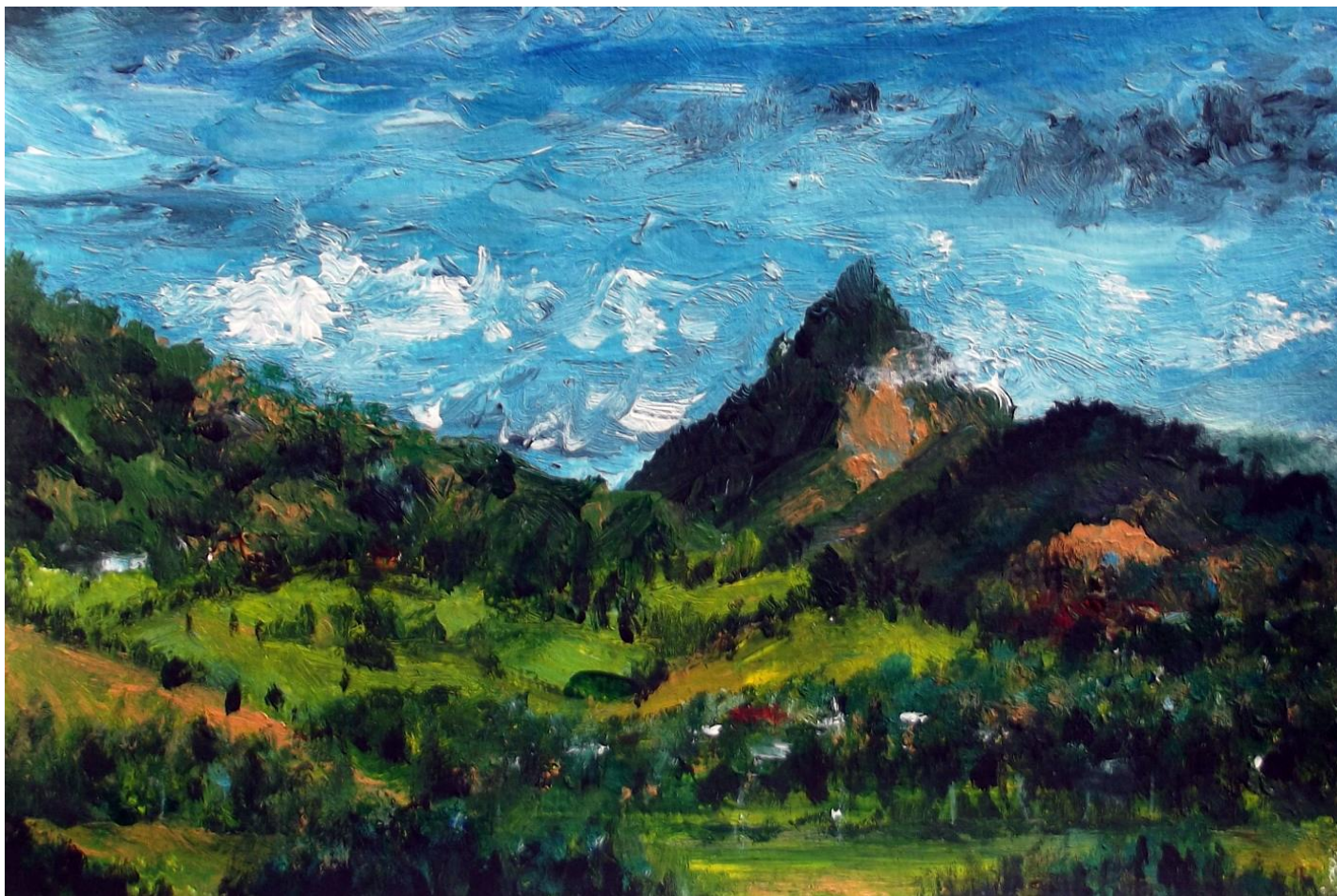
Mount warning from the studio (study no 1), 2015