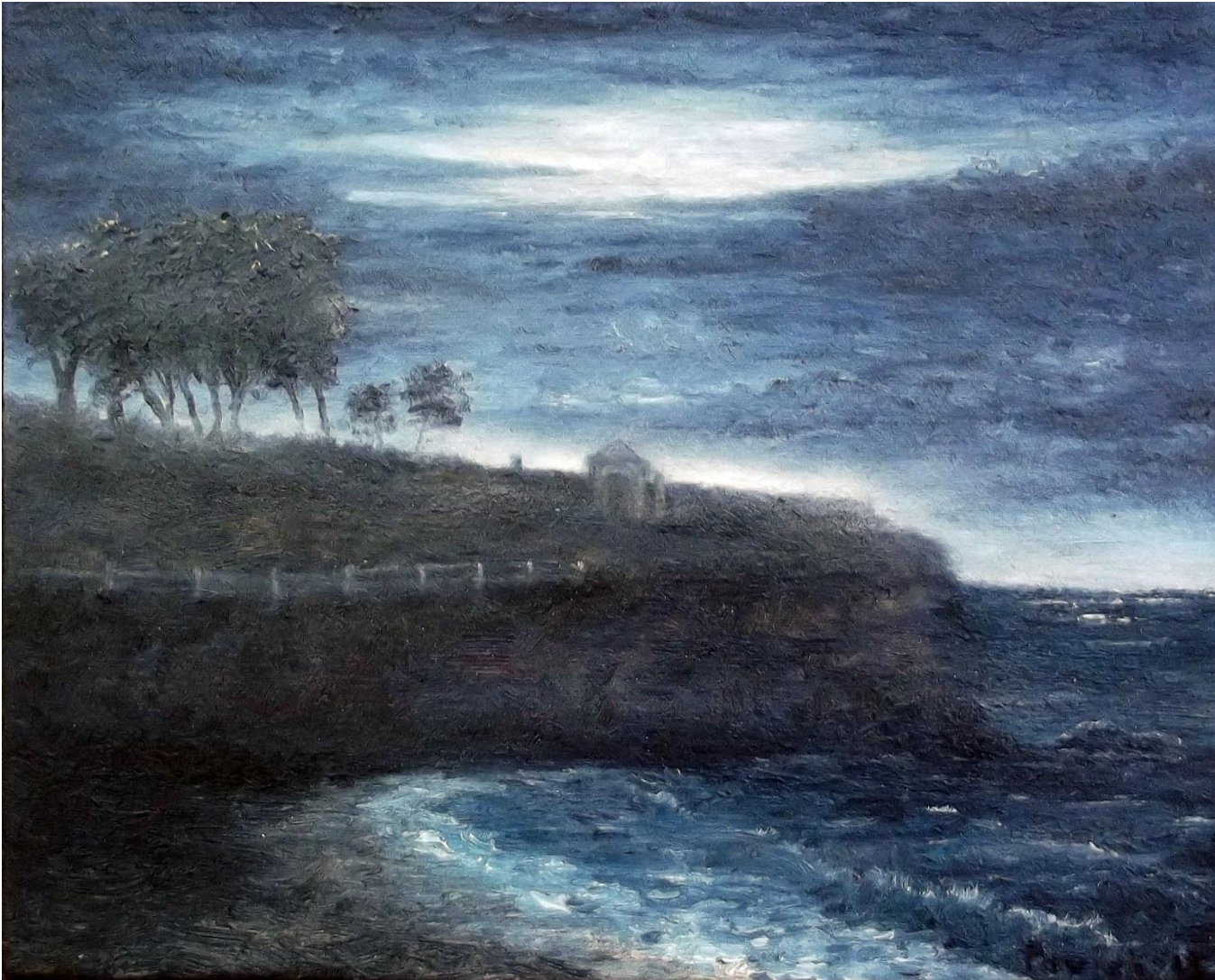
Dolphins Point (under a clear moon), 2012