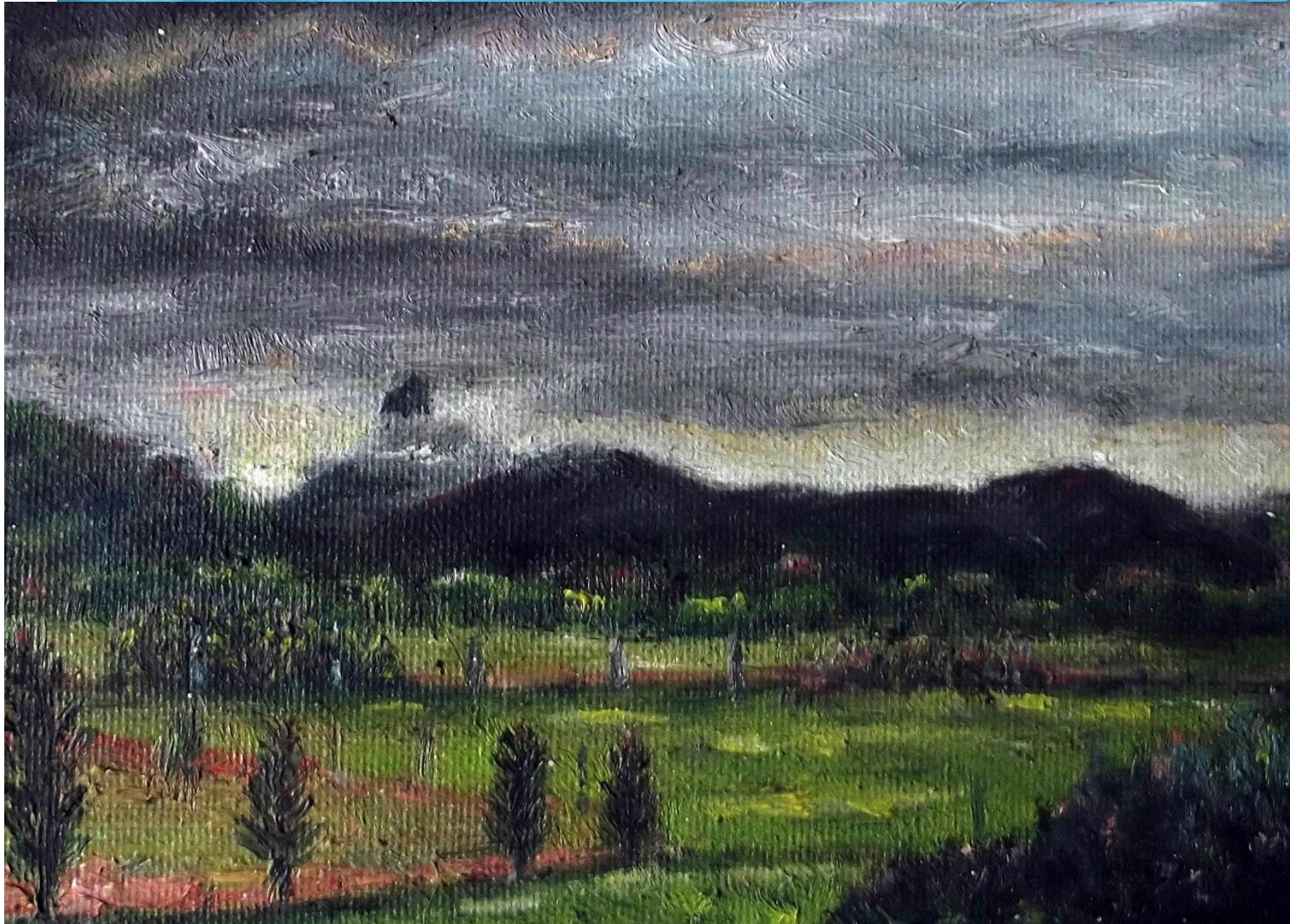
Misty Morning Murwillumbah, , 2015