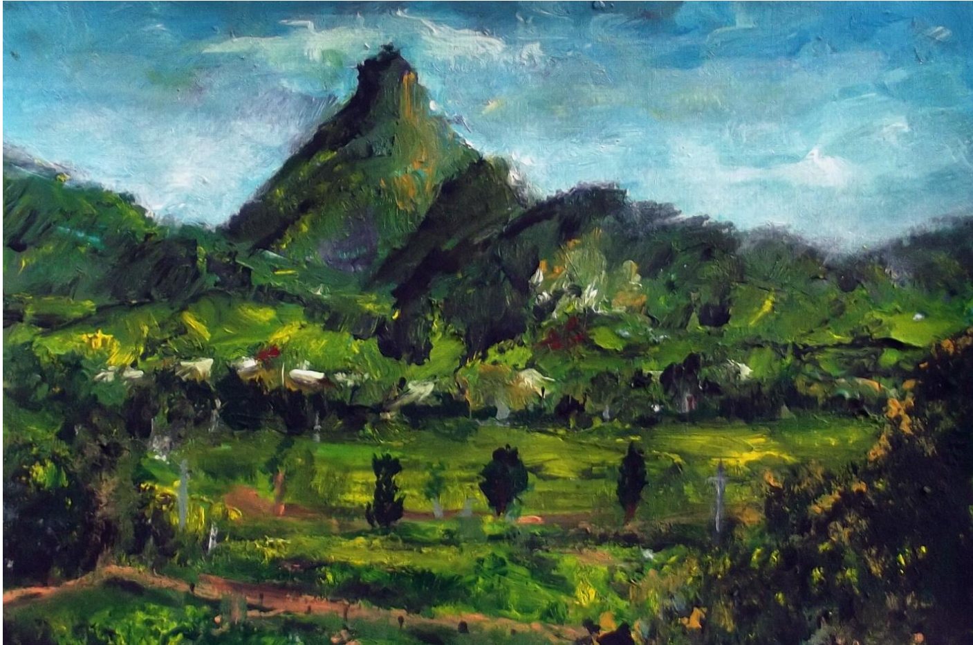
Mount warning from the studio (study no 2), 2015

Acrylic on Paper 21 cm x 30 cm $100 (unframed)