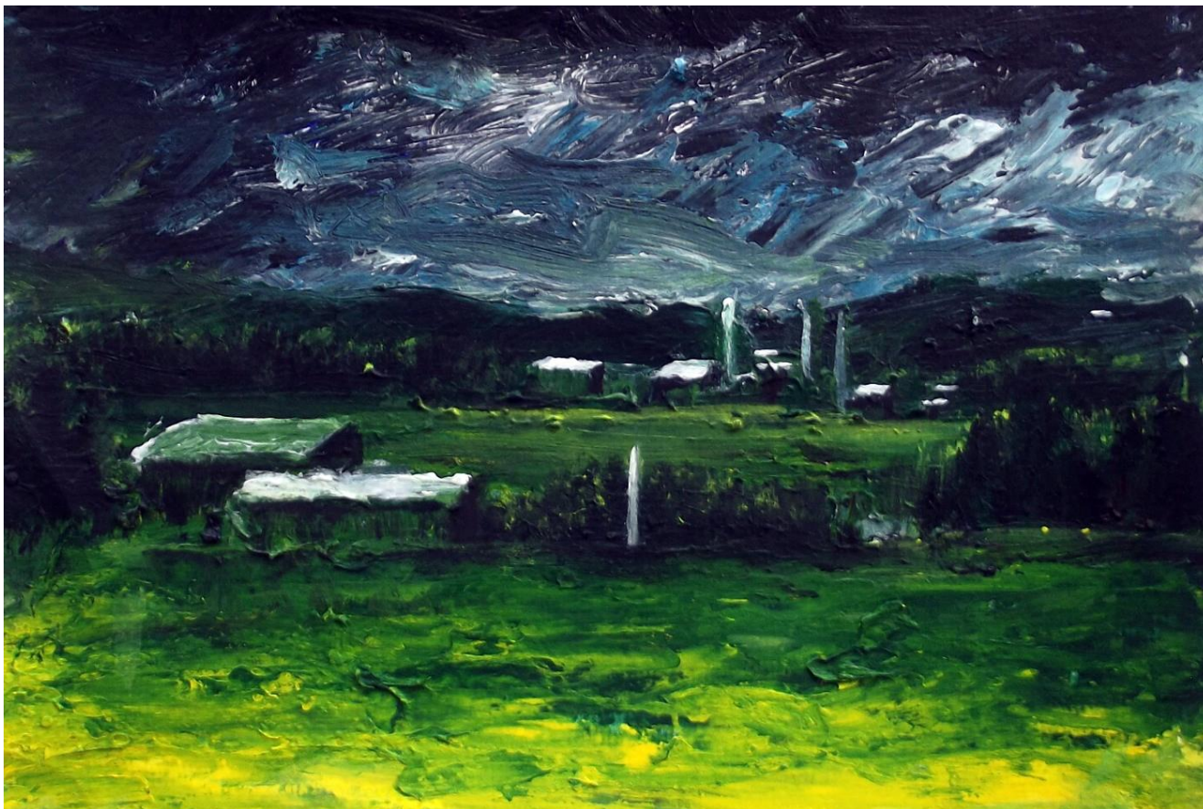
The sugar mill Murwillumbah, study, 2015