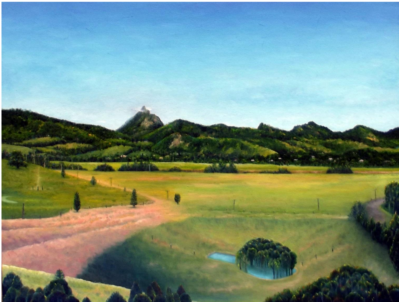
A clear day ( Murwillumbha), 2015