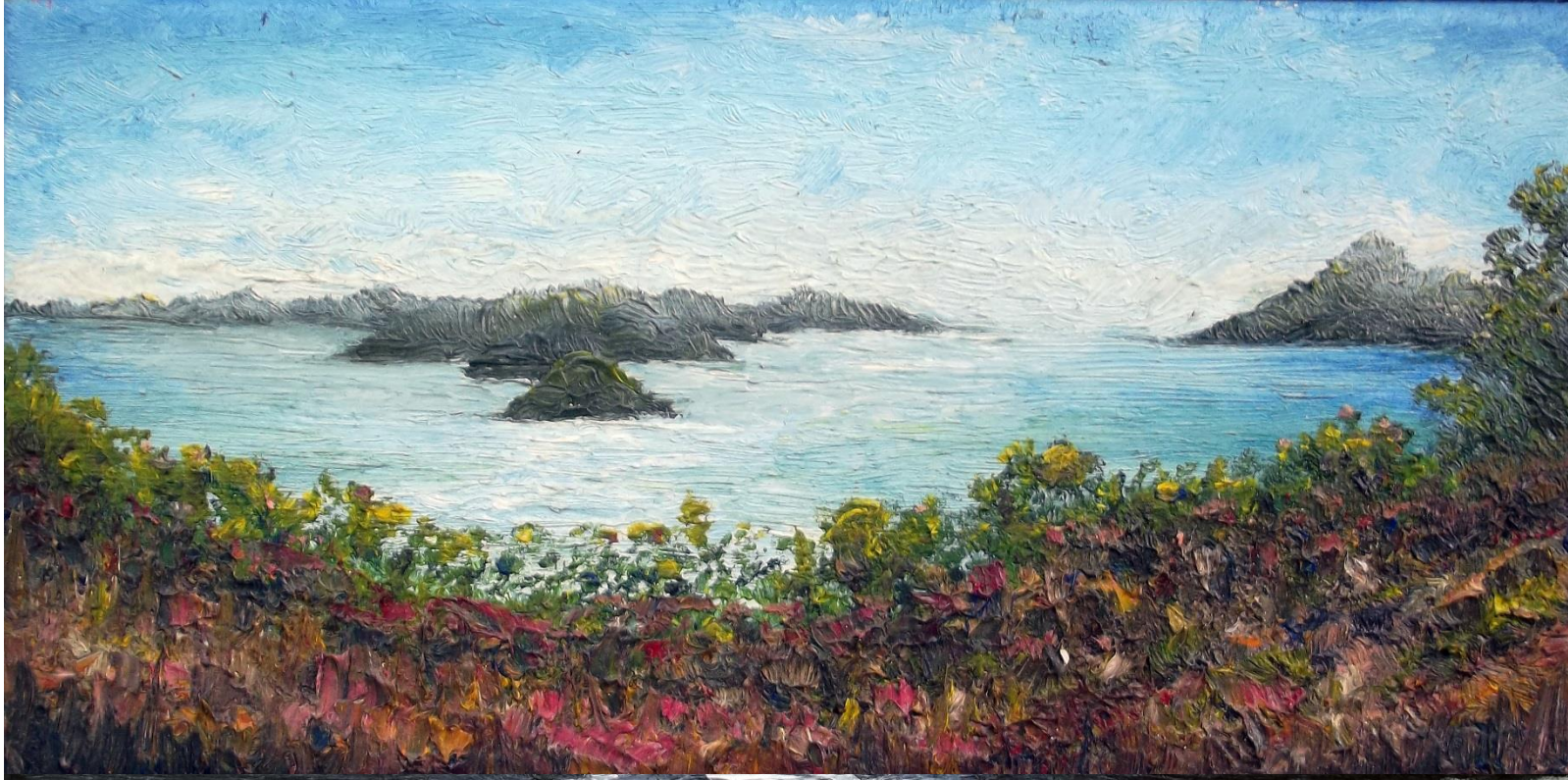
Hamilton Island towards Fitzalen Islands, 2014 Oil on Poly Cotton 15cm x 30cm $600 (Framed)