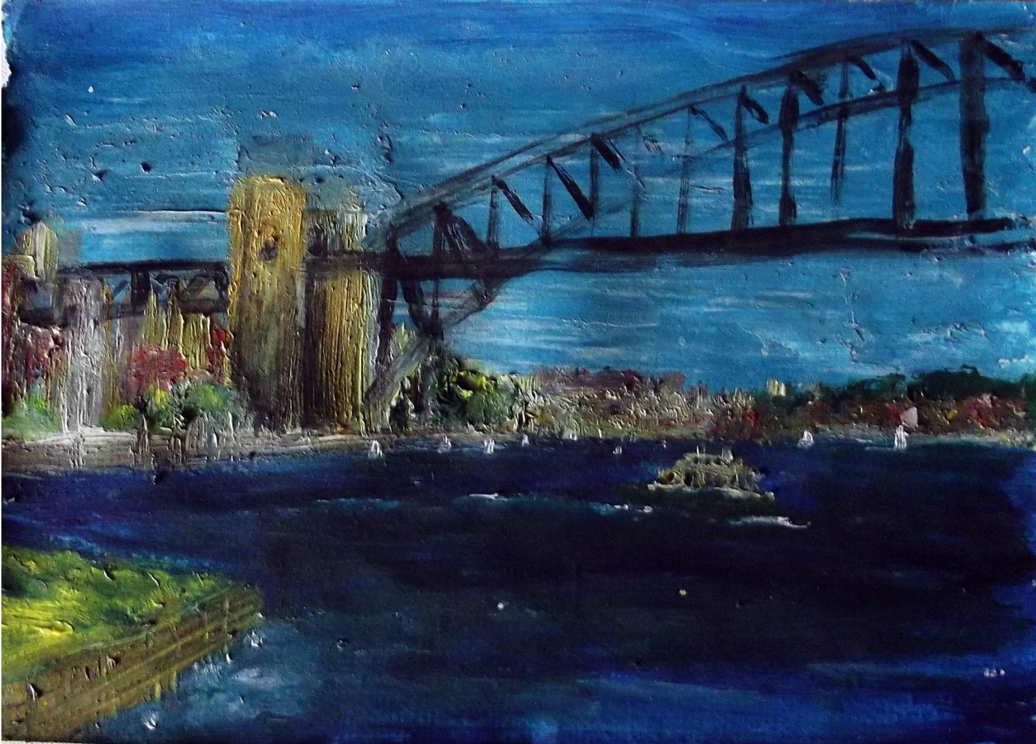
Harbour study no 2, 2017 Acrylic on paper 21cm x 30cm $100 (unframed)