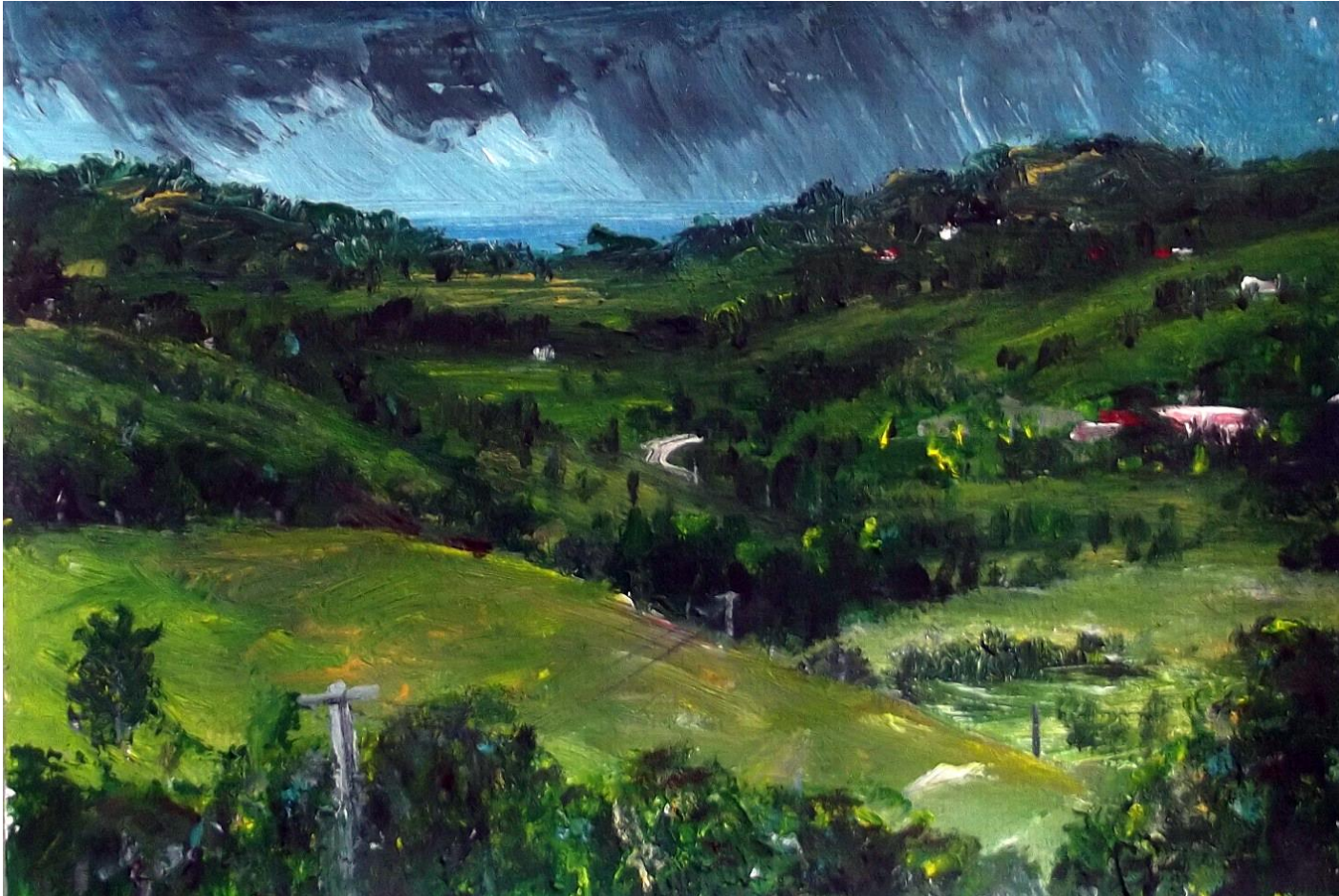
Towards Kingscliff from Murwillumbah, study, 2015