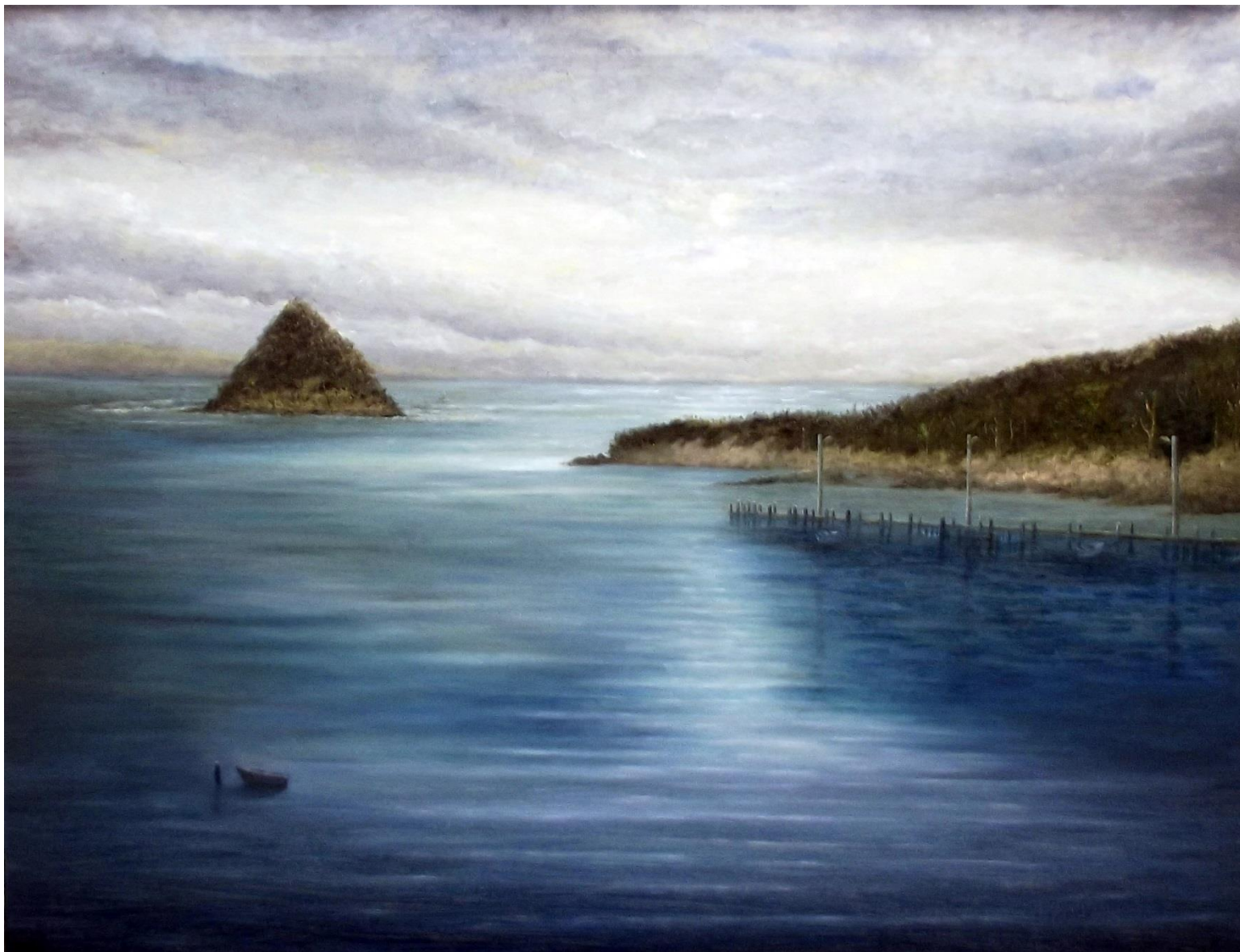
Beyond, 2012 Oil on Poly Cotton 76cm x 102cm $3800