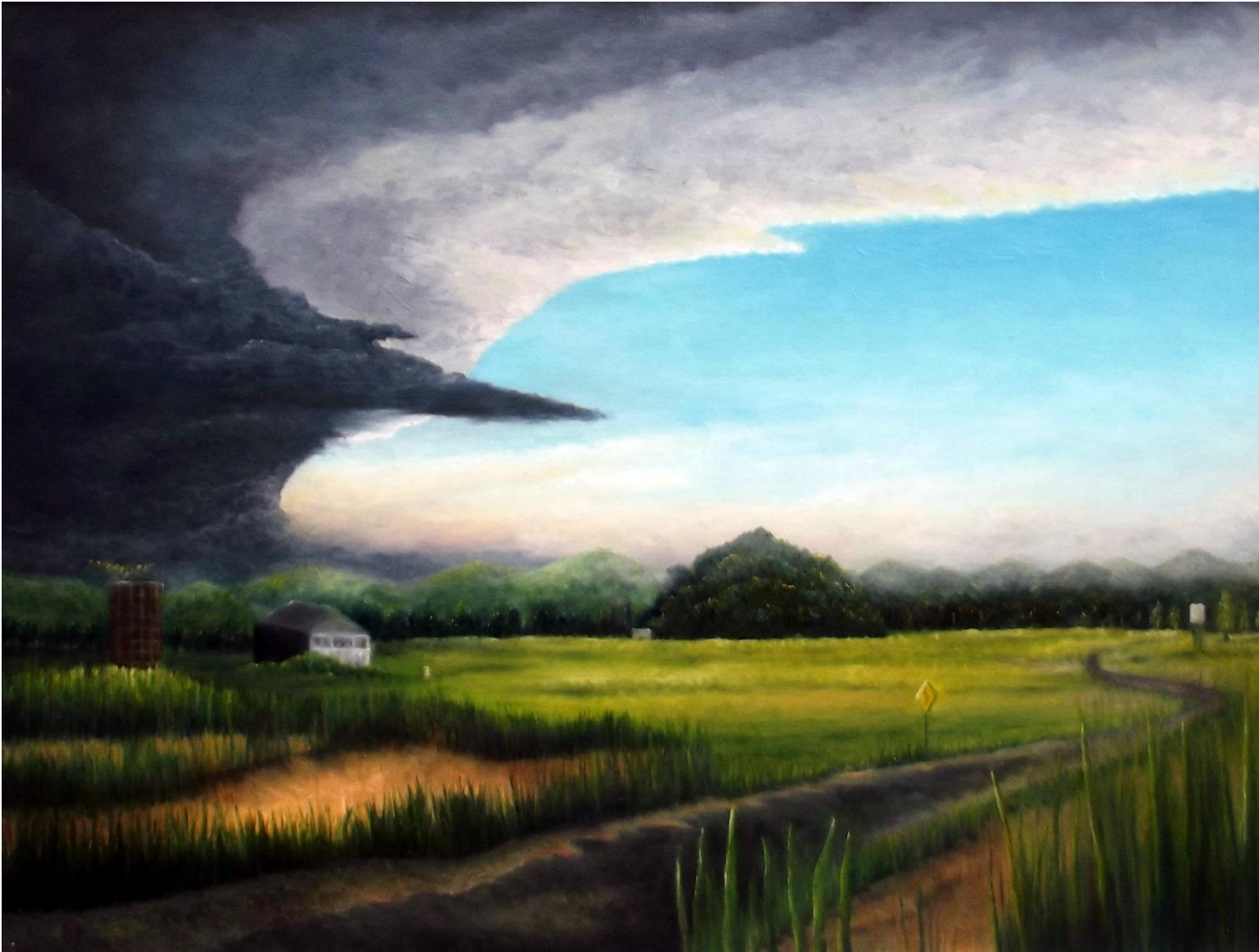
The winding road (Murwillumbah), 2015